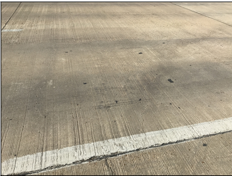
Approach slab cracks